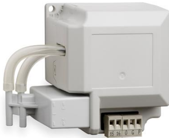
Off-board Air Module (550-819B).